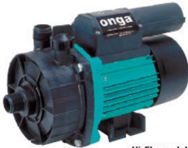
Hi-Flo model 413